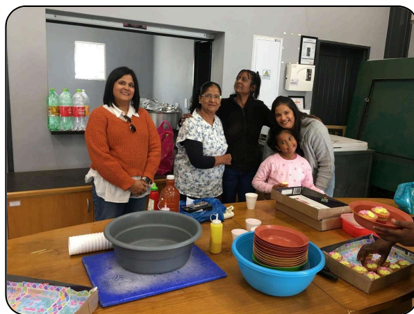
A day with the Joseph's